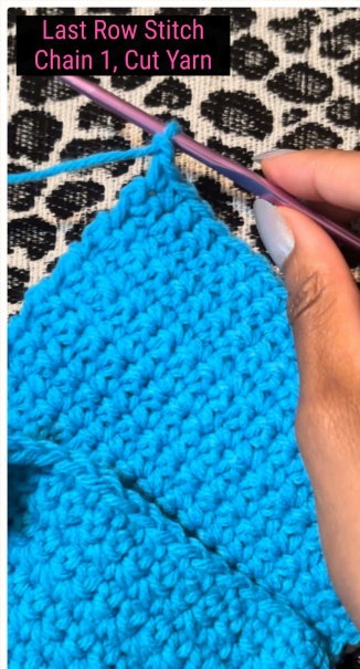
Last Row Stitch Chain 1, Cut Yarn